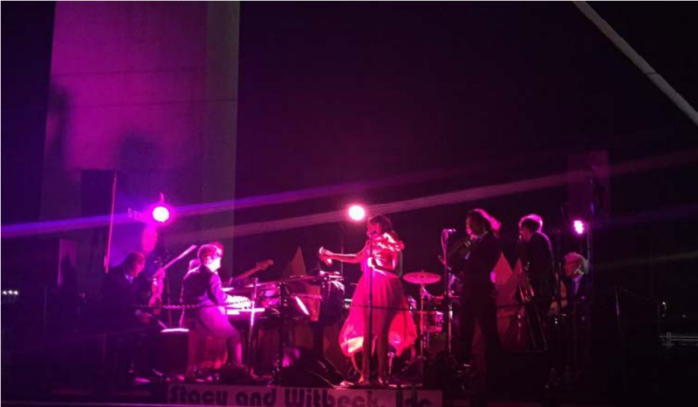
Pink Martini provides a movable concert from the back of a truck inching its way across the Tilikum Bridge Thursday evening.

Portland's Tilikum Crossing on the Willamette River was aglow Thursday night, as hundreds of guests celebrated what TriMet billed as the "First Light" event for the new transit, pedestrian and bicycle bridge.